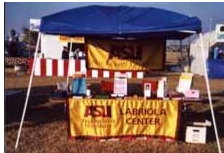
LAB FILM S104:579

ASU's Indian Studies Program; the Center for Indian Education; the American Indian Institute; and the Labriola National American Indian Data Center shared a booth at the Pueblo Grande Indian Market, which was held at Steel Indian School Park on December 13th and 14th, 2003.