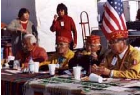
LAB FILM S104:594

Navajo code talkers and the Hopi Piestewa family were special and honored guests.