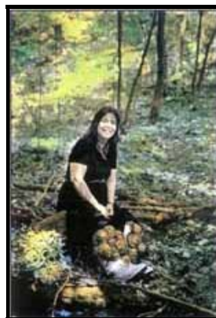
Wilma Mankiller (Cherokee Nation) Author, Activist, and former Principle Chief of the Cherokee Nation of Oklahoma