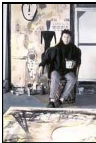
Jaune Quick-to-See Smith (Flathead Salish) Painter and Printmaker