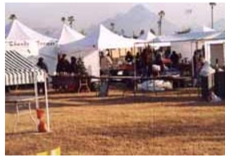
LAB FILM S104:580

There was storytelling, fry bread, buffalo burgers, lamb on Navajo tacos, parched corn, Hopi piki bread, demonstrations on flint knapping, a hands-on mural painting, and a fashion show.