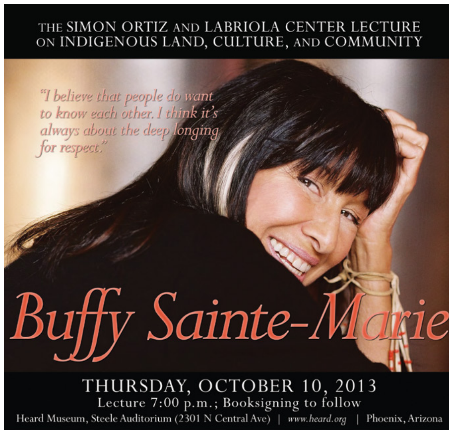
Photo of Buffy Sainte-Marie