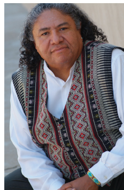
Edgar Heap of Birds

Heap of Birds' art work was chosen by the Smithsonian's National Museum of the American Indian as their entry