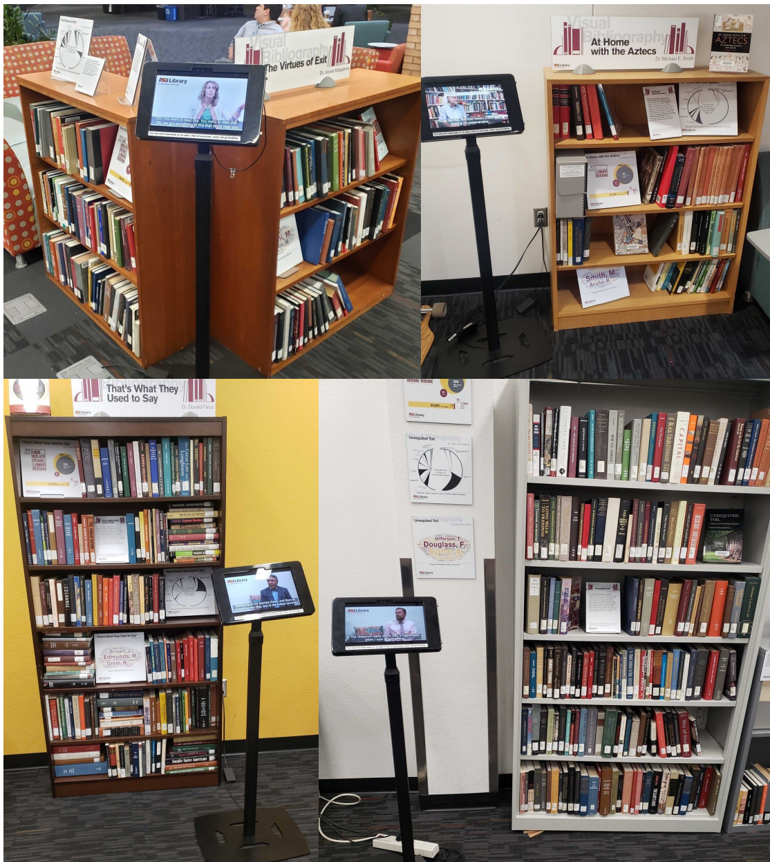
Photos of the four book and video displays at Noble Library