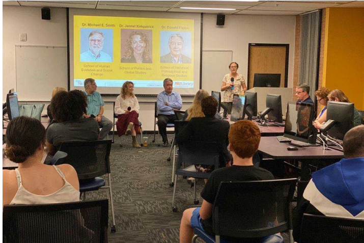
Photo of the three faculty members at the Opening Reception event